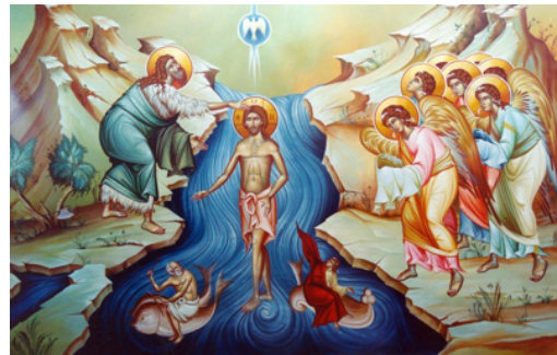
“Christ is Baptized! In the Jordan!”